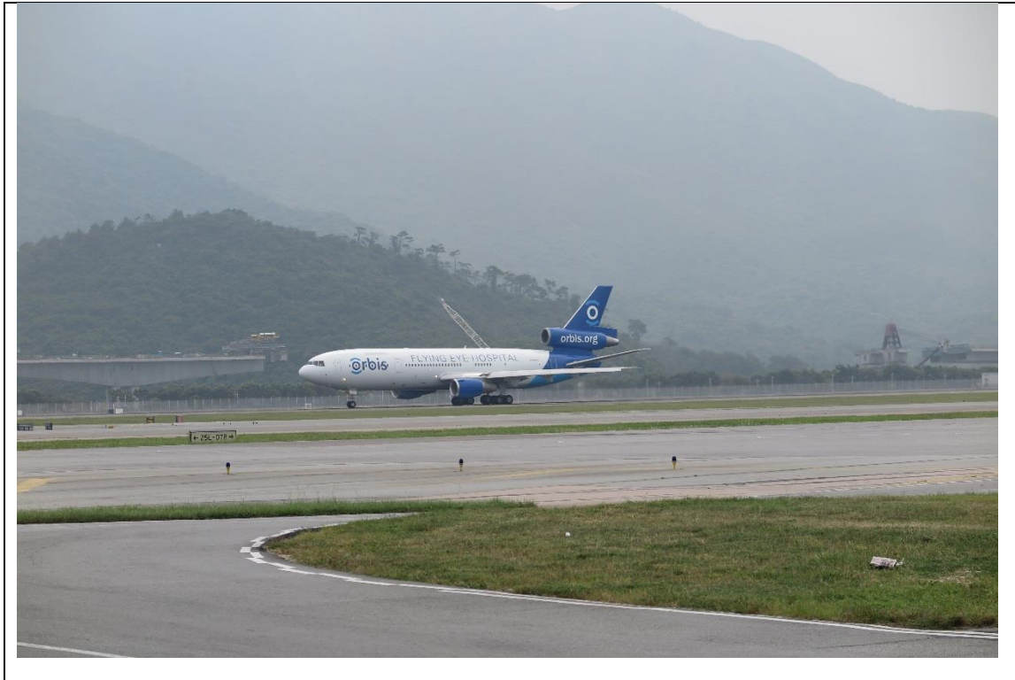
Photo 1: Orbis Flying Eye Hospital took off from the Hong Kong International Airport