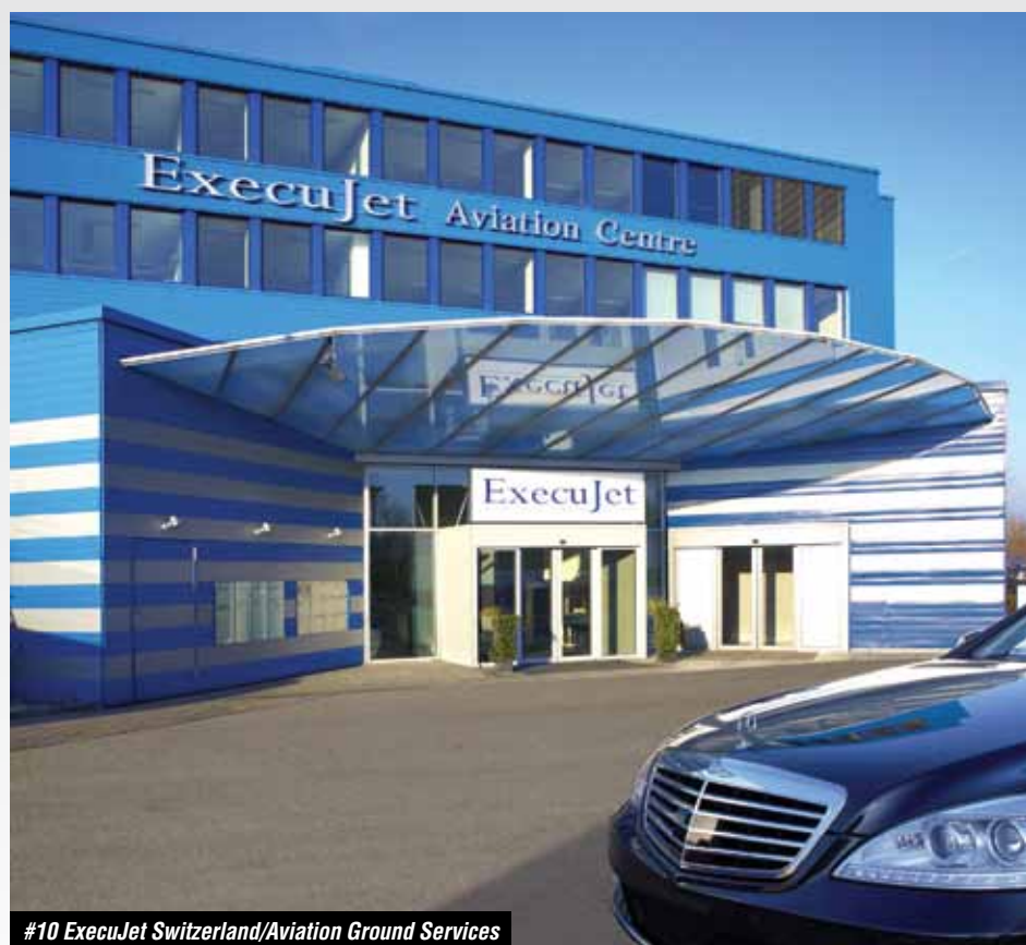
#10 ExecuJet Switzerland/Aviation Ground Services