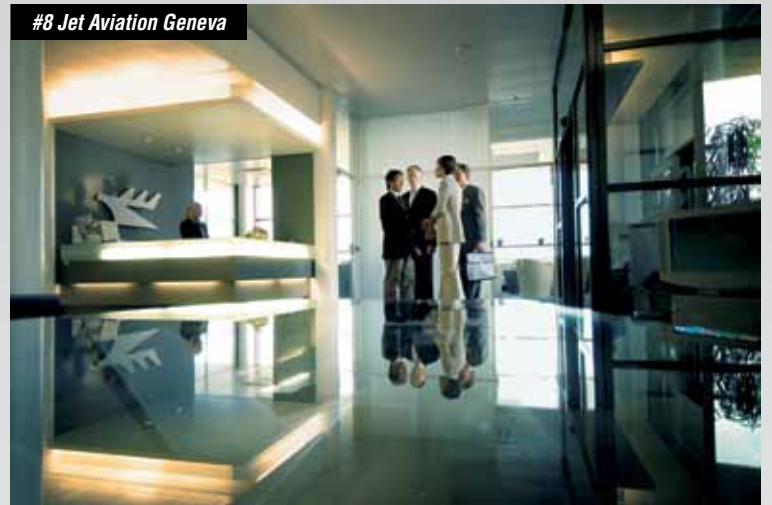
#8 Jet Aviation Geneva

43,000-sq-ft hangar. This has allowed it to relocate the reception area for maintenance clients from the main section of the FBO to create more space for handling customers. TAG is an authorized service center for both Dassault and Bombardier business aircraft.