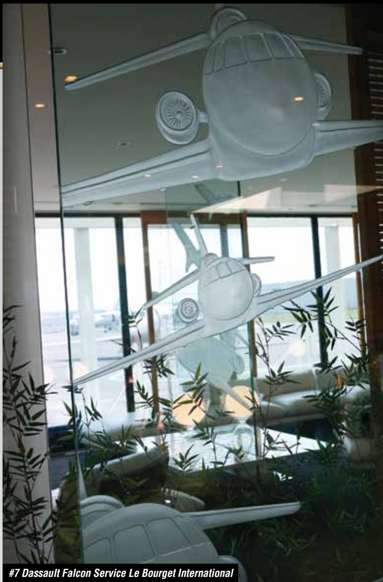
#7 Dassault Falcon Service Le Bourget International

Aviation International News FBO SURVEY 2011 • THE REST OF THE WORLD ► Continued from page 24