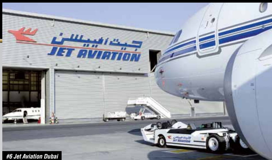
#6 Jet Aviation Dubai