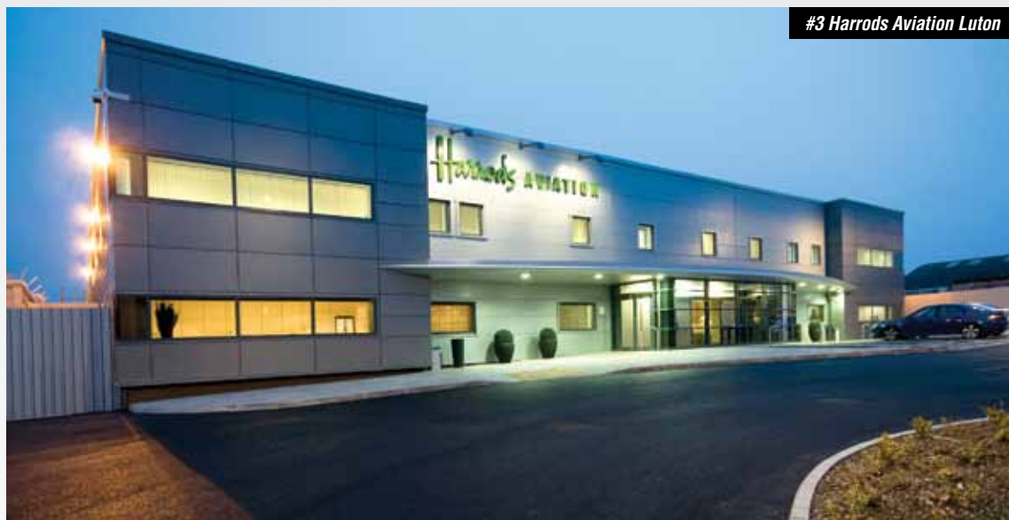
#3 Harrods Aviation Luton