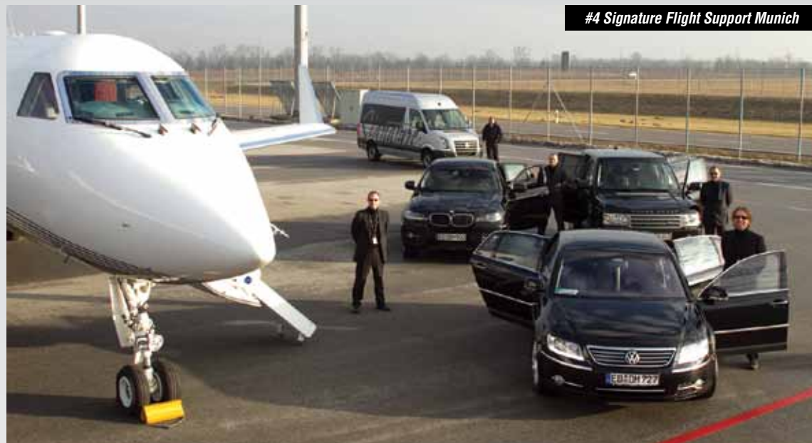
#4 Signature Flight Support Munich

average scores of these operations were higher than for FBOs in the 30-plus rankings but an insufficient statistical foundation to make it to the top table.