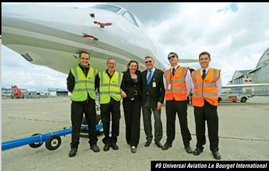
#9 Universal Aviation Le Bourget International