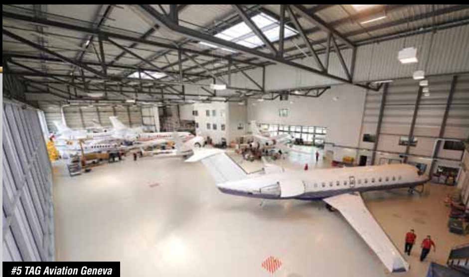
#5 TAG Aviation Geneva