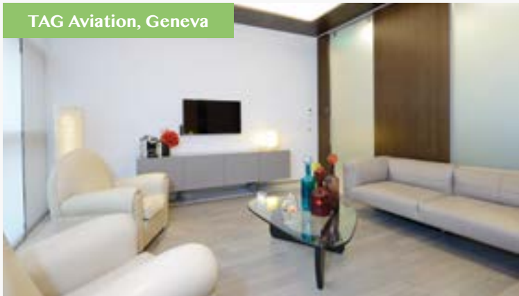
TAG Aviation, Geneva