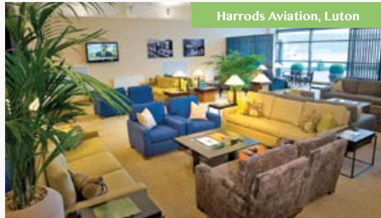
Harrods Aviation, Luton