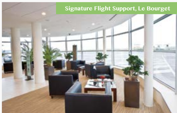
Signature Flight Support, Le Bourget